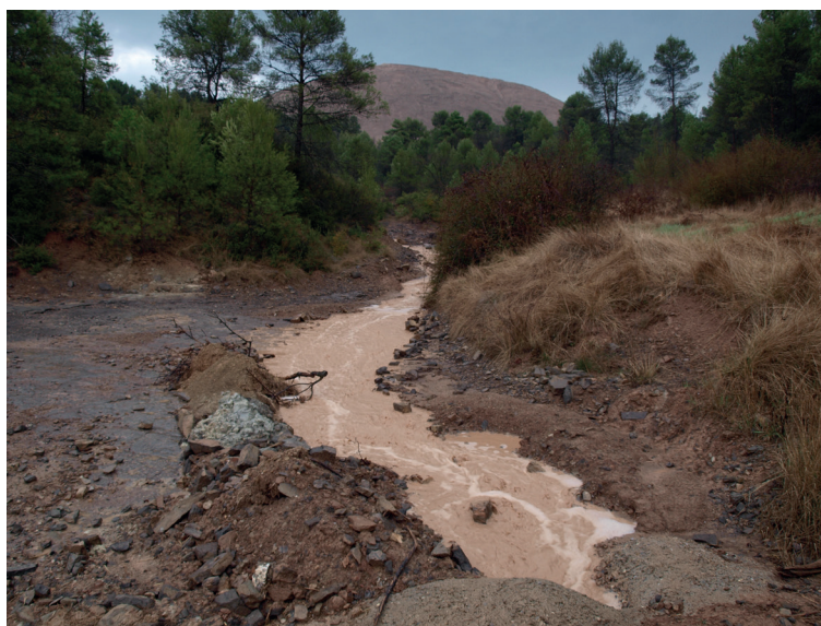
Figure 3. Impacted stream (Torrent de Soldevilla, Catalonia, Spain) by potash mining. Riparian vegetation is absent from the margins of the stream. The mine tailing (mainly composed by NaCl) can be seen in the back of the picture. Arroyo impactado (Torrent de Soldevilla, Cataluña, España) por la minería de potasa. La vegetación ribereña está ausente de los márgenes del arroyo. El relave de la mina (compuesto principalmente por NaCl) se puede ver en la parte posterior de la imagen.

collapse of fish populations in the Aral Sea, which were the main source of food and jobs for local residents (Micklin, 2007). Also, recreation and aesthetic values of freshwater ecosystems can be seriously compromised by salinization, due to a decline in habitat quality and biodiversity (Fig. 3). Finally, linked with ecosystem services, there are important economic and social costs associated with salt pollution of freshwaters (Cañedo-Argüelles et al. , 2016; Schuler et al. , 2019; Schulz & Cañedo-Argüelles, 2019). Saline waters corrode infrastructure (Wilson, 2004; Moore et al. , 2017) and increase water treatment costs (Honey-Roses & Schneider, 2012). Moreover, when salinity increases the water can become useless for agriculture, domestic consumption and many industrial uses (Williams, 2001b; Kaushal, 2016, Schuler et al. , 2019). Salinized water not only can become unpalatable and damage crops, it can also pose important risks to human health. In Bangladesh seawater intrusion in the coast is leading to health problems (e.g. preeclampsia, hypertension) and forced migrations of millions of people